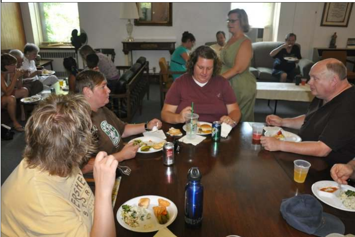
St. James' Day