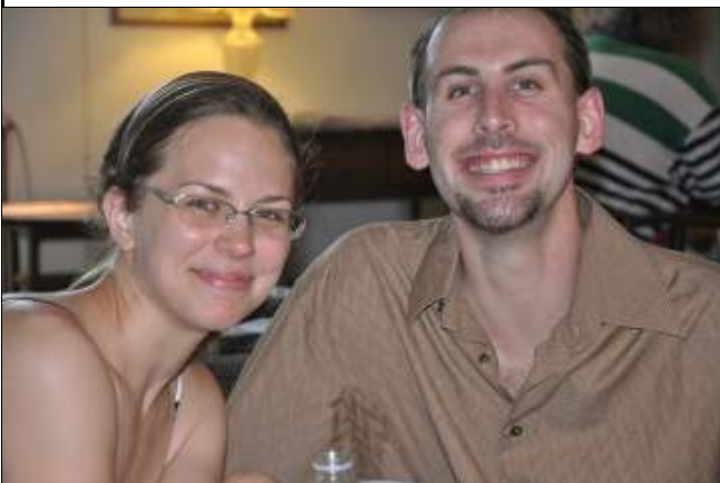
St. James' Day